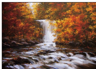
ABOVE: 'Autumn Vista' is one of a series of new paintings that artist Tim Howe was compelled to paint after traveling the Blue Ridge Parkway.